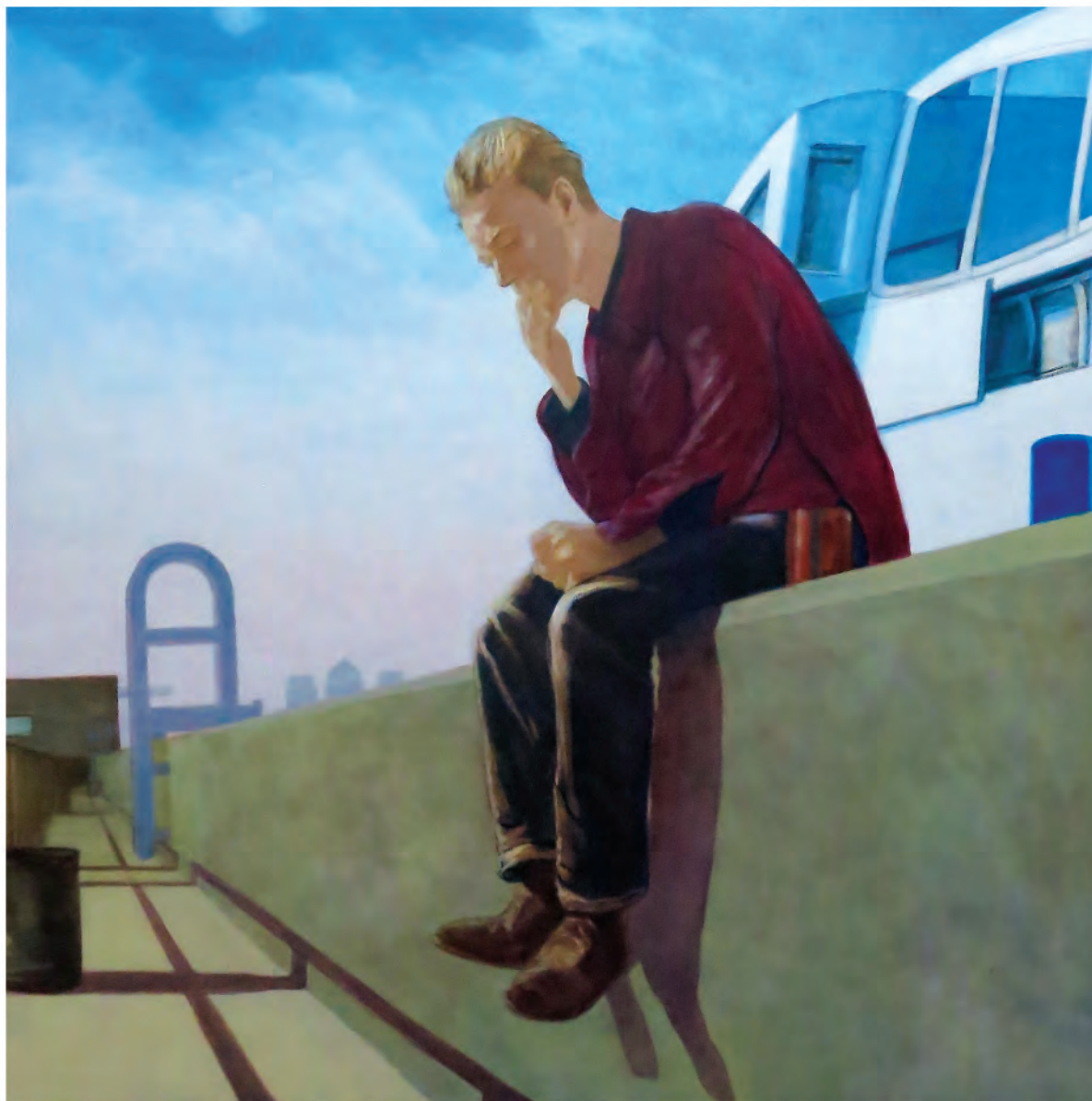
Treasure island 2015 Oil on linen 122 x 122 cm