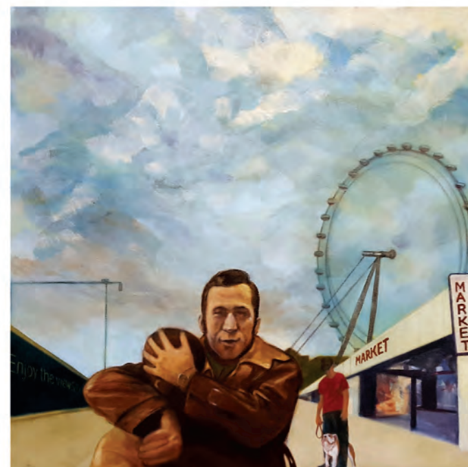
Clockwise from top left: Guy (detail) Oil on linen