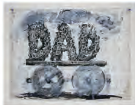
Dad - Marcus Harvey 2012 Acrylic, ink and pastel on newsprint 60 x 75 cm

The ‘ Strictly Bull Terriers Forum ’ describes the breed’s character thus: “ Fiercely energetic, and loving, this breed can also be protective of his owner and his territory, giving off somewhat of a fearless presence. This breed makes a good watch and/or guard dog. The Bull Terrier is very hardy and sturdy and can tolerate quite a bit of child’s play, however should always be supervised, as Bull Terriers can be snippy if they are overly pestered. With proper socialisation and training, this breed can do well with other dogs ”.